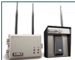
wireless expansion up to 24 entry points