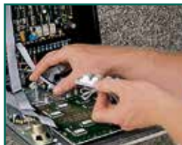
modular easy installation and service