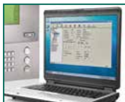
pc programmable easy to use software included