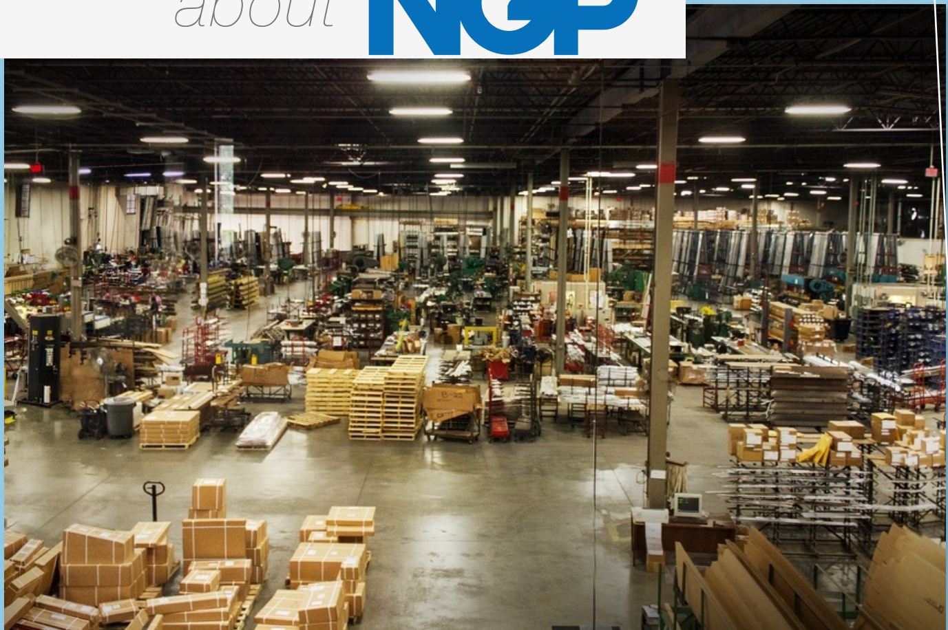
National Guard Products in Memphis, Tennessee