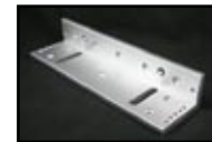
10LZBRMAG1UL (1) 'L' and (1) 'Z'