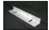
10LZBRMAG3UL (1) 'L' and (1) 'Z' use with 10MAGLOCK3UL