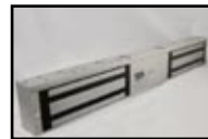
10MAGLOCK5UL 1200LB - DOUBLE