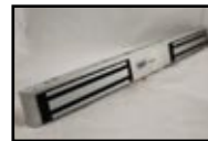
10MAGLOCK6UL 600LB - DOUBLE