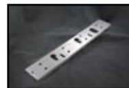
Vertical Spacer Bars