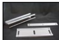
10UBRACKETUL U-Bracket - Glass Doors