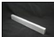
10FILLER12UL 10FILLER34UL FILLER BAR