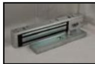
10MAGLOCK3UL 600LB - SINGLE