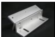
MAG5LZUL MAG6LZUL (2) 'L' and (2) 'Z'