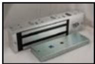
10MAGLOCK1UL 1200LB - SINGLE