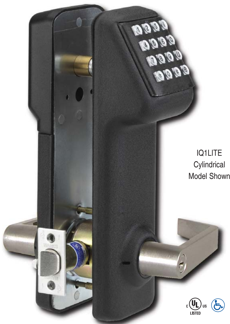
IQ1LITE Cylindrical Model Shown