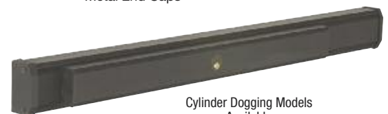
Cylinder Dogging Models Available

Base and Push-Pad: Extruded Aluminum Mechanical Components: Stainless and Hardened, Plated Steel Latch and Strikes: Sintered Steel Metal End Caps