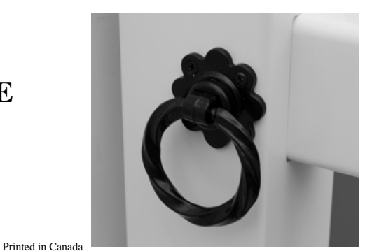
Back of Gate View