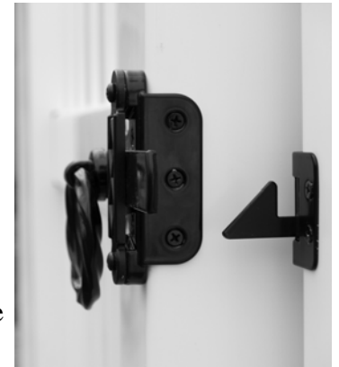
Wrap Around View