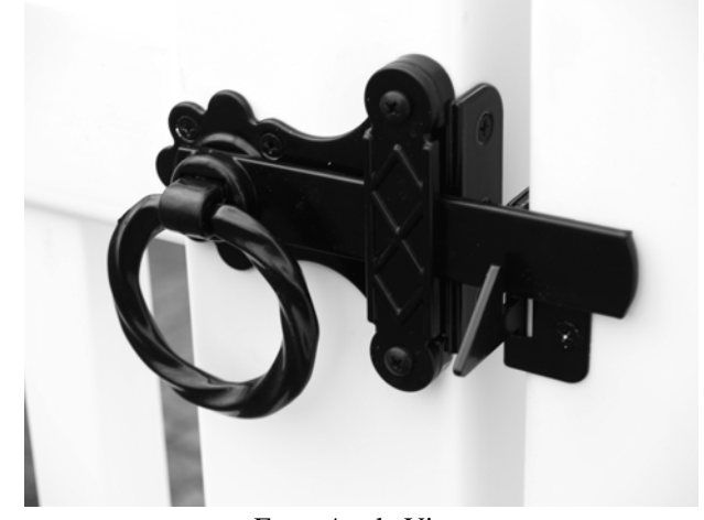
Front Angle View

A space of ½" to 1" is suggested between the gate and the gate hinge post.