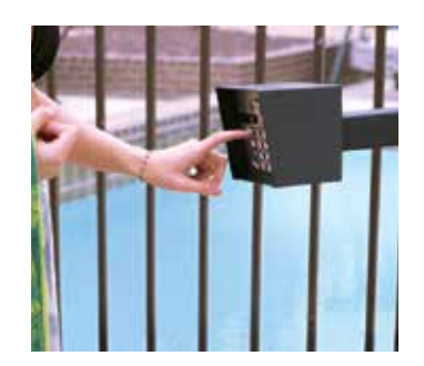
* for use with 1812 Access Plus

Access point control with keypads, card readers or RF receiver*