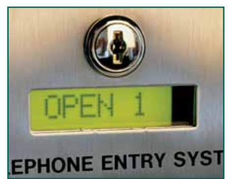
built-in display indicates door/gate has been opened