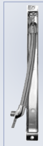
EPT300 Concealed Stainless Steel