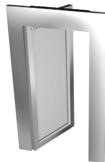
Low Energy Doors