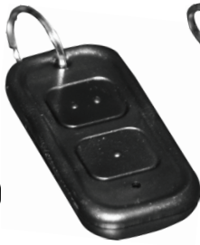
9RCT4332 Two Button