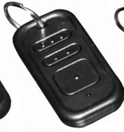
9RCT4333 Three Button