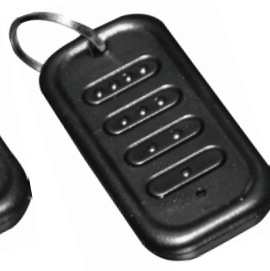
9RCT4334 Four Button