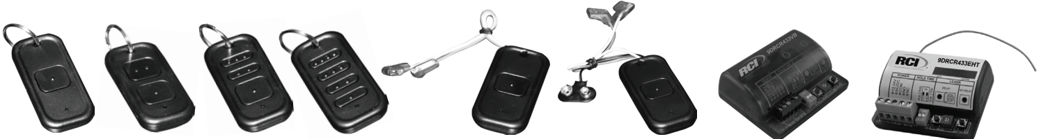
9RCT4331 One Button