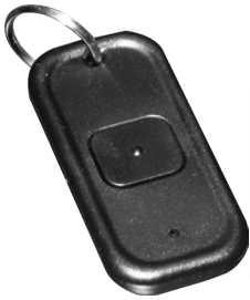
9RCT4331 One Button