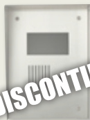
KA-FSH Flush Mount Housing Panel for KB-DAR or KB-DAR-M