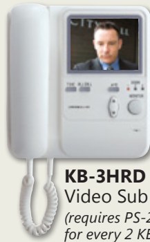
KB-3HRD Video Sub Master Station (requires PS-2420UL for every 2 KB-3HRDs) • 4" LCD screen • Handset for privacy 7-11/16" H 7-5/16" W 3-5/16" D