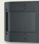
KMB-45 Mullion Mounting Bracket for KB-DAR, KB-DAR-M, or IF-DA