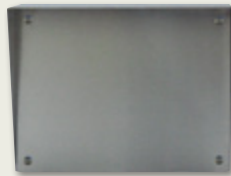
SBX-ACE Surface Mount Box for AX-DM, IF-DA, KB-DAR, or KB-DAR-M and one Access Control Device