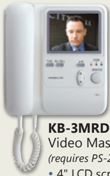
KB-3MRD Video Master Station (requires PS-2420UL) • 4" LCD screen • Handset for privacy 7-11/16" H 7-5/16" W 3-5/16" D