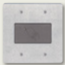
HID-SS Card Access Station with HID® ProxPoint® Plus Proximity Card Reader