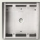
SBX-2G Surface Mount Box for IE-JA, IE-SS/A, or IE-SSR