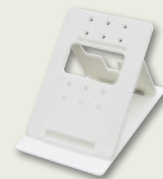
MCW-S/A Desk Stand for KB-3MRD or KB-3HRD