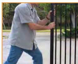
fail-safe release never be locked out (or in)