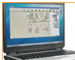
gate tracker reporting output