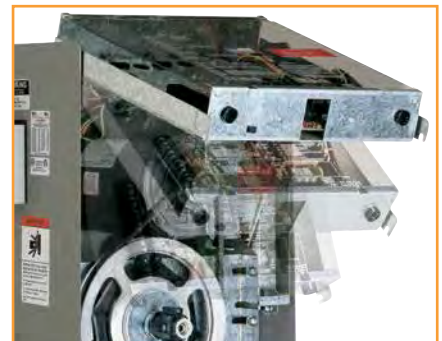
unique design allows easy access to all mechanical parts