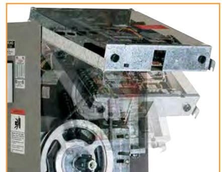
unique design allows easy access to all mechanical parts