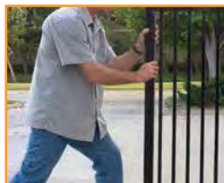
fail-safe release never be locked out (or in)