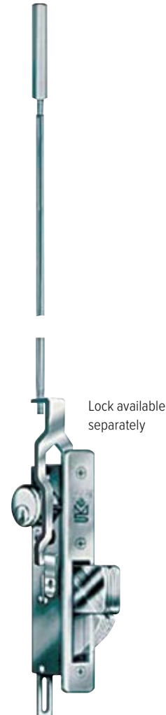
Lock available separately