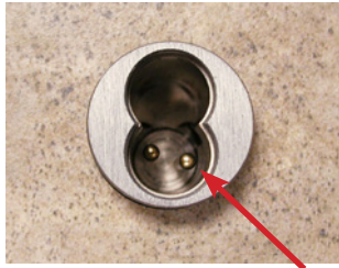
Figure 1 Prong position