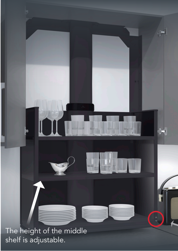
The height of the middle shelf is adjustable.