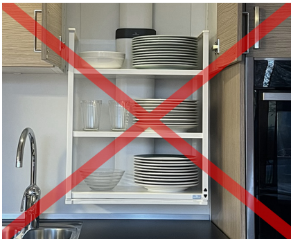
Incorrect load distribution!

If the owner fits accessories, contact Granberg to get approval of the loading conditions.