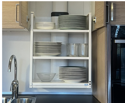
Correct load distribution!