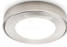
Trim ring surface mount application