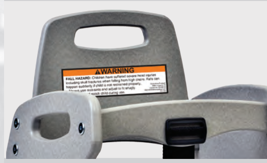
Integrated handles makes this chair easy to maneuver around the dining room

The name of our ECO Chair truly speaks for itself — this chair is manufactured from 100% post-consumer plastic, and its smooth surfaces allow for quick cleaning. The ECO sits at table height. This low-maintenance model is perfect for high-traffic establishments.