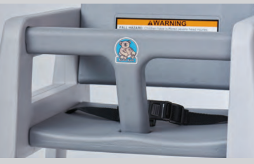
Passive crotch restraint system provides added safety.