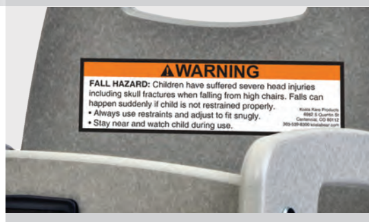
Visible warning label for compliance with ASTM F404-18 standard.