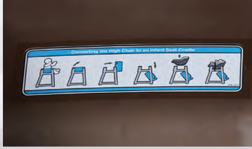
Diagram helps guests safely convert high chair to an infant seat cradle.