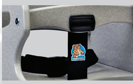
Passive crotch restraint system and three point harness keeps child safely in place.