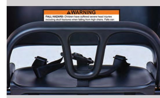
Handbar and leg hole design provides child comfort.