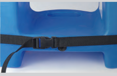
Safety strap fastens securely to adult chair.