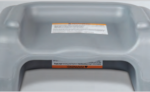
Booster seat can be used on either side depending on the need of the patron.