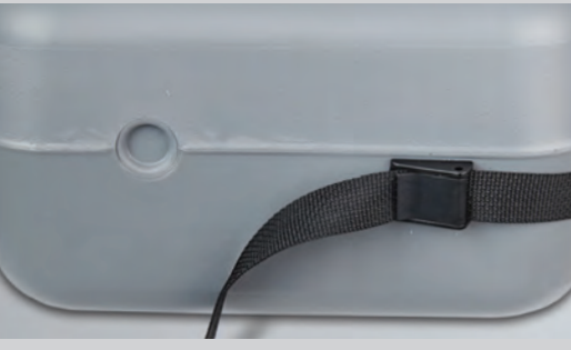
Strap safely fastens to adult chair.