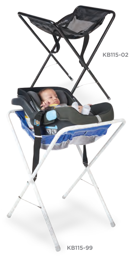
Koala saat Kradle

ASTM F404-18 does not apply to this product