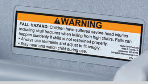
Visible warning label for compliance with ASTM F404-18 standard.