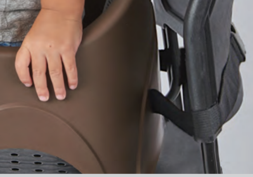
Rear strap securely fastens to adult chair for safety.