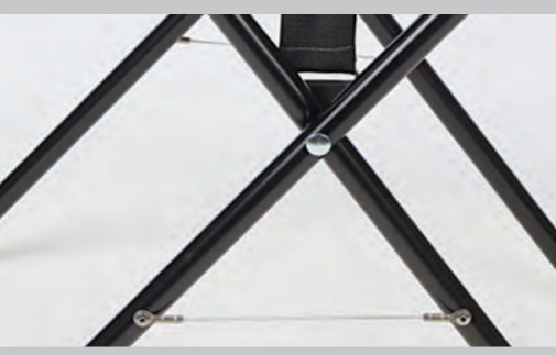
Tubular steel legs with reinforced cables for strength and durability.

Build loyalty among your patrons by providing accommodations for even your youngest guests. Our Infant Seat Kradle safely holds an infant carrier at table height. The unique design reduces potential liability by eliminating the unsafe act of balancing an infant carrier on an upside-down high chair. This model features tubular steel legs with reinforced cables for strength and durability and easily folds to compact size for storage.