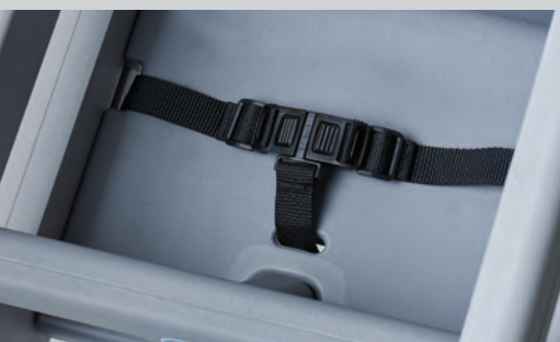
Active three-point restraint system keeps child safely secured.