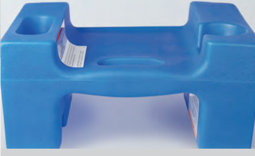
Easy carry handle