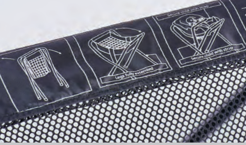
Safe and easy operation in three steps.