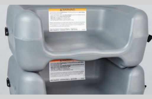
Stacks neatly for easy storage.