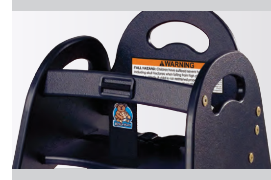
Integrated handles makes this chair easy to maneuver around the dining room