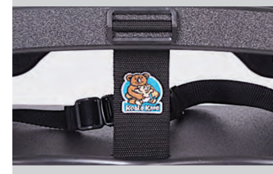
Passive crotch restraint system and three point harness keeps child safely in place.