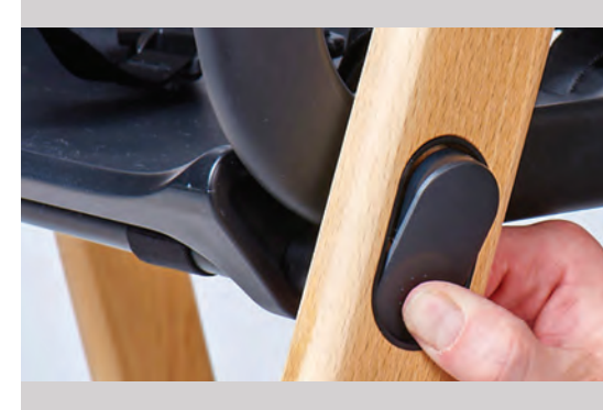
Press latches to disengage lock pins to allow the chair to be folded-up for storage.