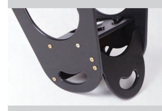
Curved design prevents chair from being used upside-down as an unsafe resting place for infant carriers.