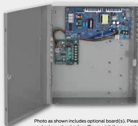
Photo as shown includes optional board(s). Please contact your local sales office or visit the support section on our website for configuration assistance.