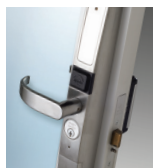
ADAMS RITE A100