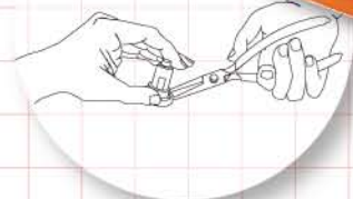
Auto Lock Cap Pliers No. ALCP-10