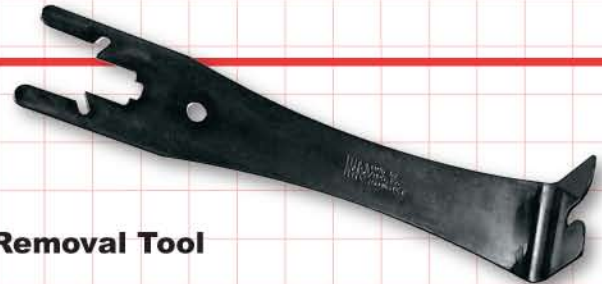
Clip & Crank Removal Tool No. AST-3

The Clip & Crank Removal Tool easily removes the hard to reach retaining clips without damage. These clips can be found on GM, Ford, Chrysler and various other vehicles.