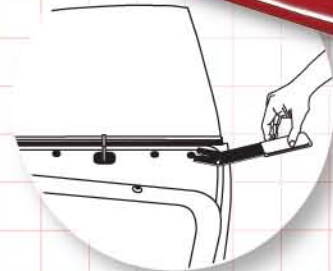
Clip Removal Tool No. AST-4