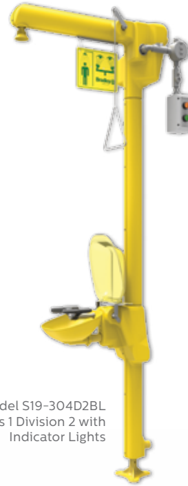
Model S19-304D2BL Class 1 Division 2 with Indicator Lights

In geographic areas where an emergency fixture may freeze, safety personnel should consider purchasing a freeze protected fixture or additional accessories to prevent the pipes from freezing.