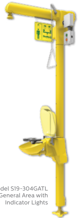
Model S19-304GATL General Area with Indicator Lights