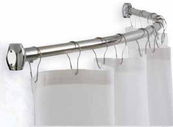
MODEL 9533, 9535, 9537 SHOWER CURTAIN